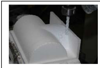
FOAM PART PROTOTYPE CUT DURING A FEASIBILITY STUDY OF A PRODUCTION PROCESS