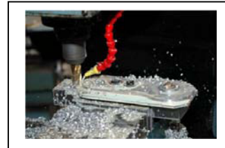
CNC MACHINING ENCODER COMPONENT

AAA has also supplied larger components and even entire machines by working closely with a large local machine shop to ensure that the component or machine meets all of the customer requirements.