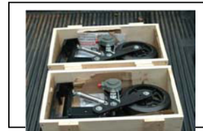
ENCODERS READY FOR SHIPMENT